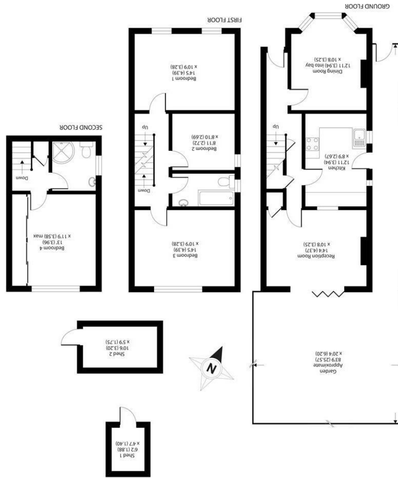
APPROX. GROSS INTERNAL FLOOR AREA 1260 SQ FT 117 SQ METRES (EXCLUDE OUTBUILDINGS)

34 Richmond Road Kingston upon Thames Surrey KT2 5ED www.gibsonlane.co.uk Tel: 020 8546 5444