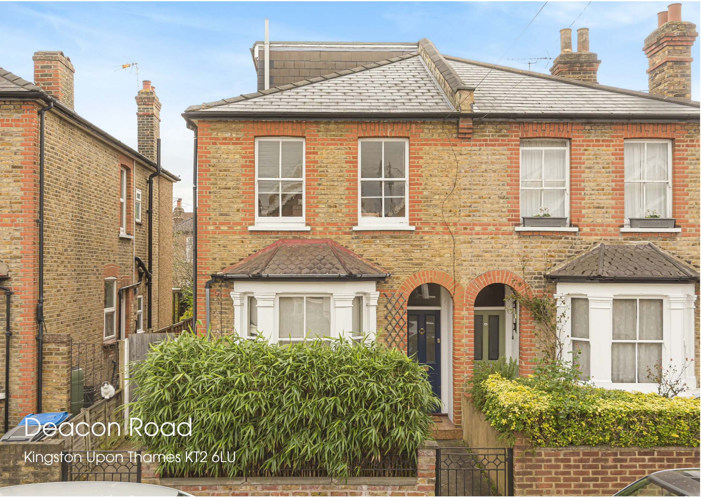
Deacon Road Kingston Upon Thames KT2 6LU